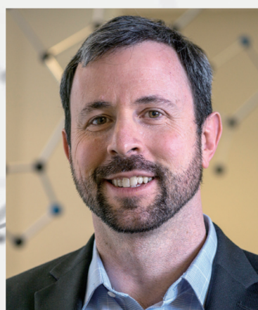
Matthew S. Sigman The University of Utah